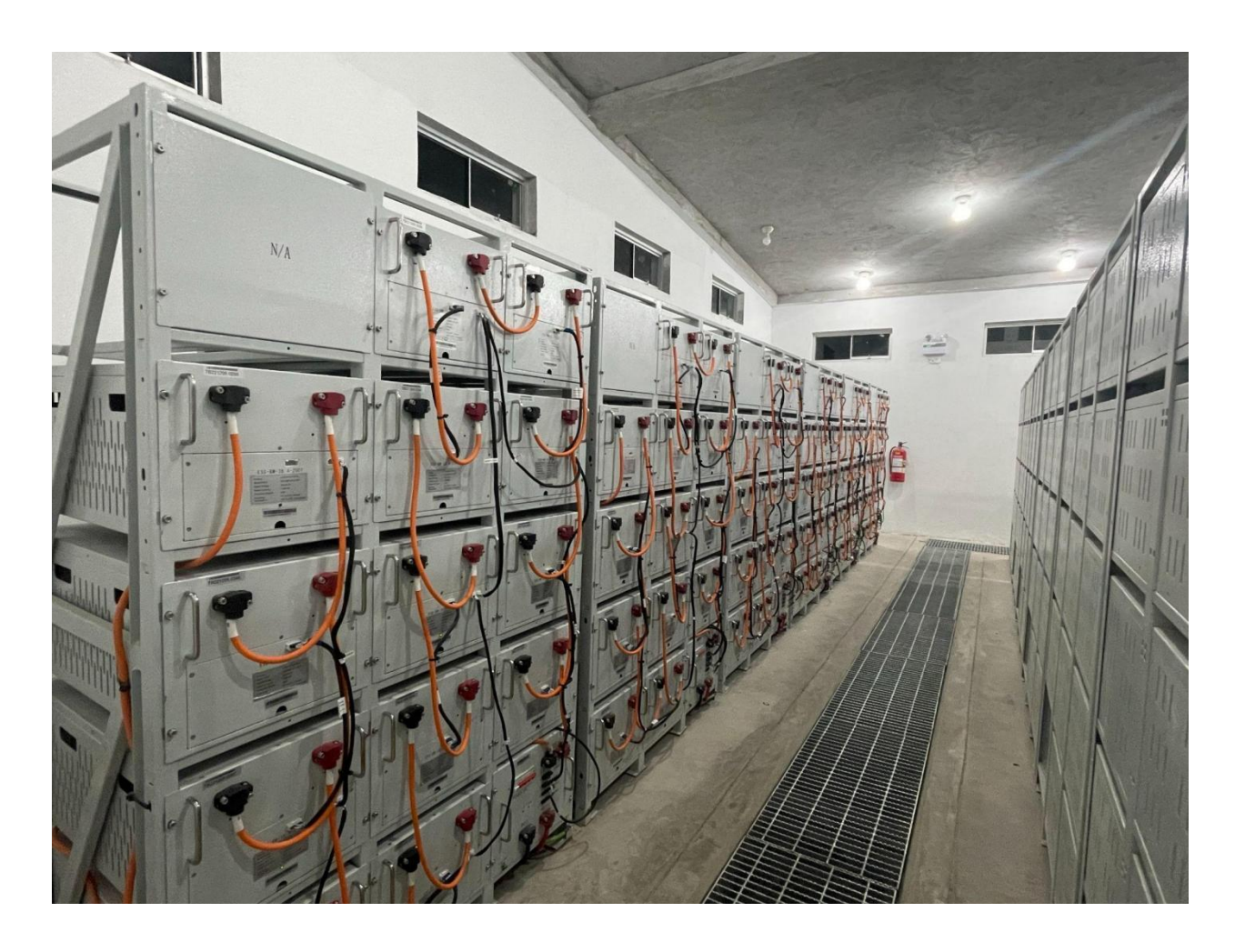
Total ATESS 16 sets of battery racks installed for the Bretaña project