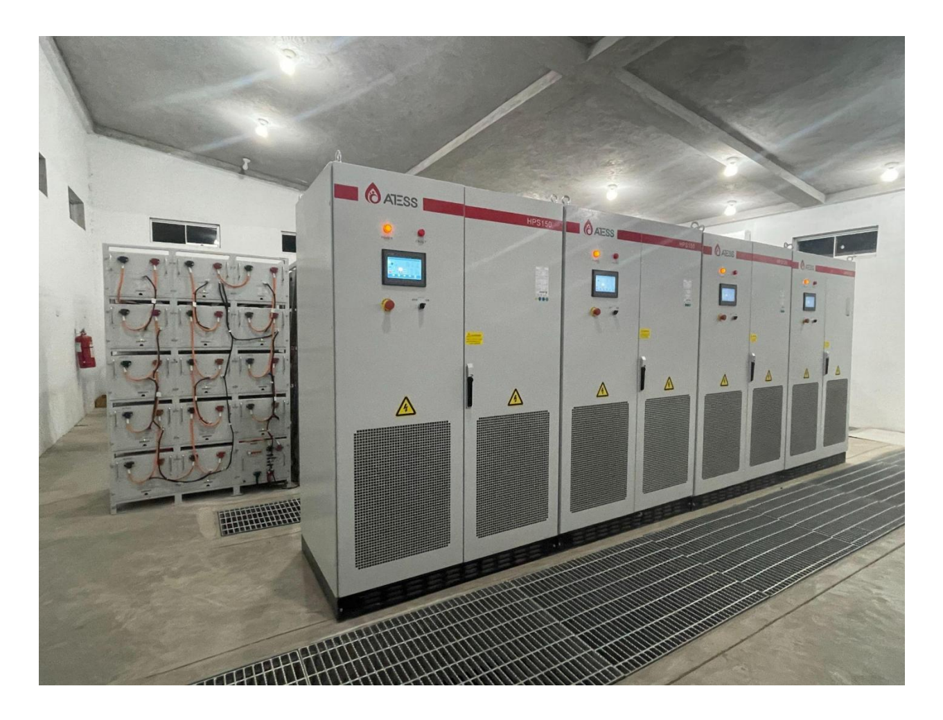
540 kW, 1,666 kWh ATESS Battery Energy Storage System (BESS) in Bretaña, Peru