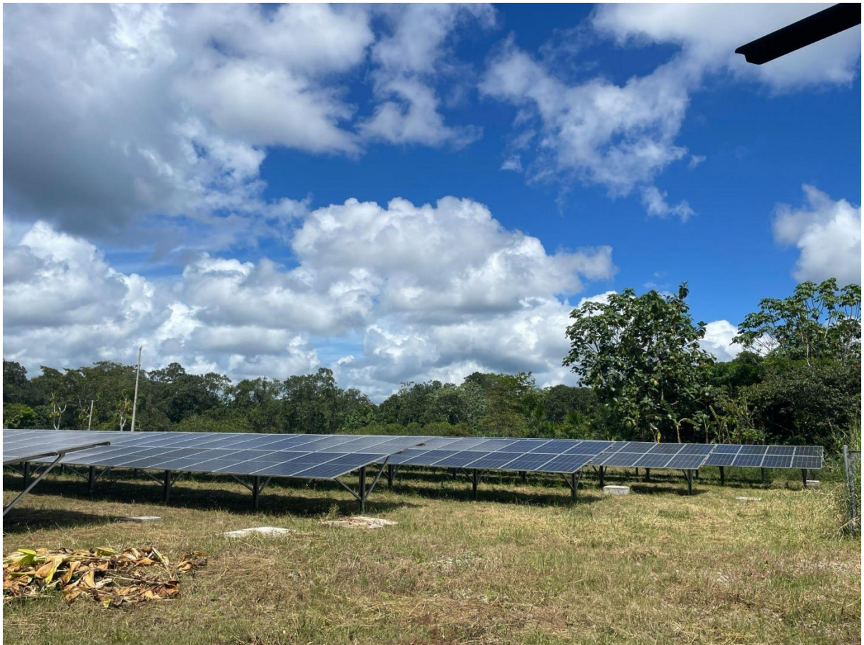
The installed PV system integrated with ATESS Battery Energy Storage System (BESS) in Bretaña

The Bretaña community faced significant power deficits. With the commencement of operations at the Bretaña power station, energy availability has surged exponentially, with an estimated 50% increase in load demand. This growth trajectory is expected to continue, driven by the expanding infrastructure and economic activities in the region.