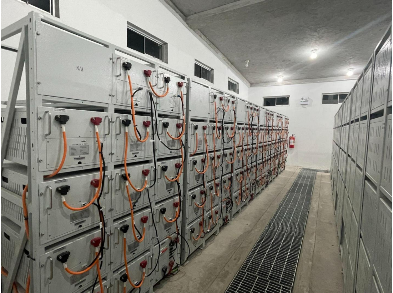
Total ATESS 16 sets of battery racks installed for the Bretaña project