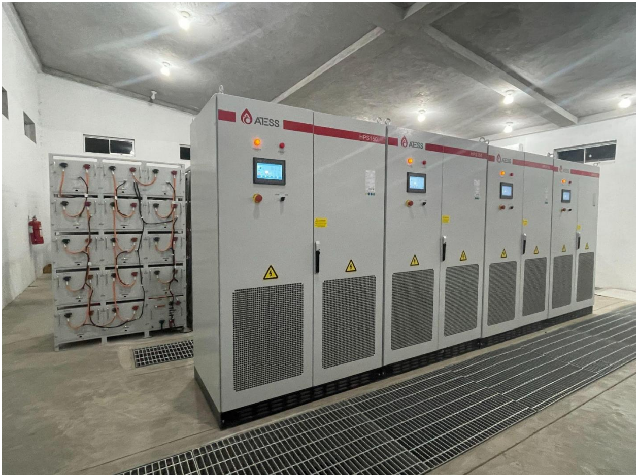
540 kW, 1,666 kWh ATESS Battery Energy Storage System (BESS) in Bretaña, Peru